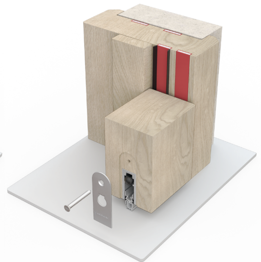
FD60 example: DS seal (Shown with LP1504 fire seal & LAS8001 si + cladding kit)

▶ Note: It's essential to consult the manufacturer to determine exactly what configuration of seal & size of seal have been tested.